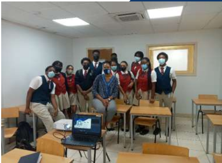
Figure 3: COCI Entrepreneurship Presentation to Charlotte Brookson Academy on April 14th, 2021