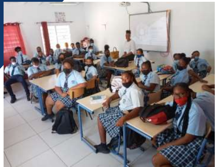
Figure 4: COCI Entrepreneurship Presentation to MAC High on April 15th, 2021.