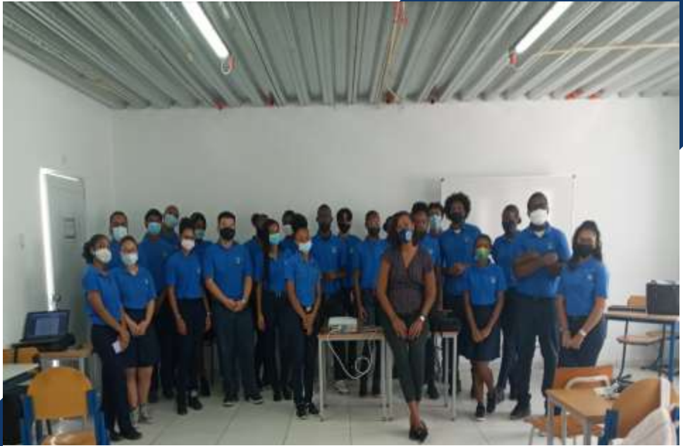
Figure 5: COCI Entrepreneurship Presentation to St. Maarten Academy on May 10th, 2021.