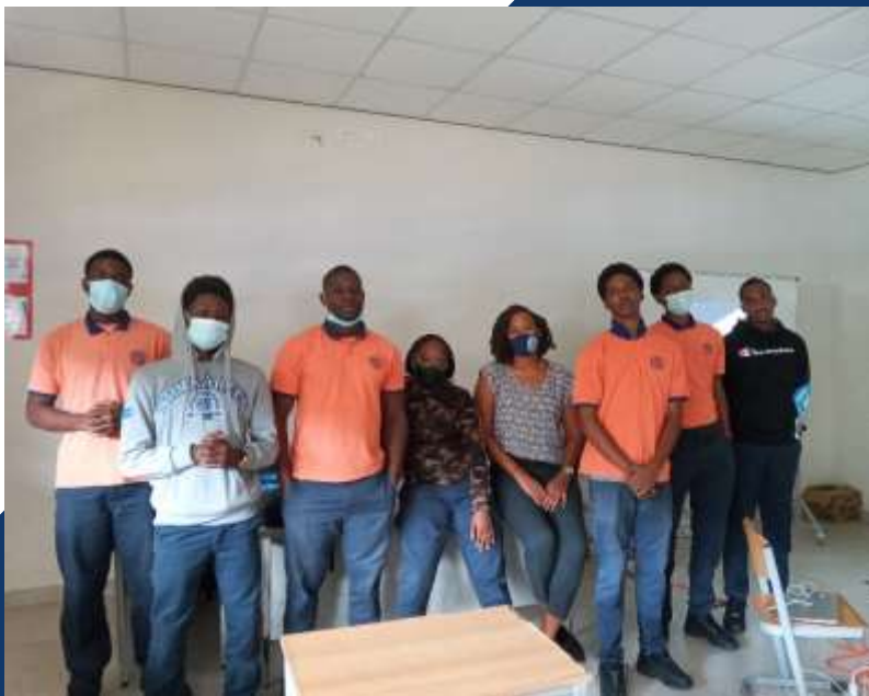
Figure 6: COCI Entrepreneurship presentation at St. Maarten Vocational Training School on May 12th, 2021