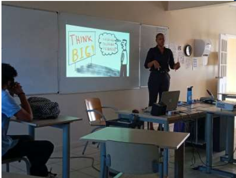
Figure 2: COCI Entrepreneurship Presentation to CIA on March 22nd, 2021.