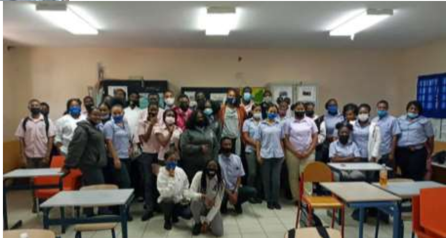
Figure 7: COCI Entrepreneurship presentation at Sundial School on June 1st, 2021.